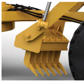
MID MOUNT SCARIFIER